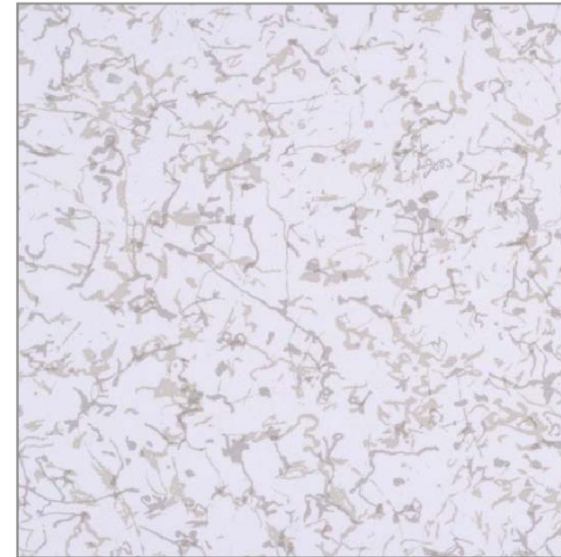
Top View of HD 24 Panel